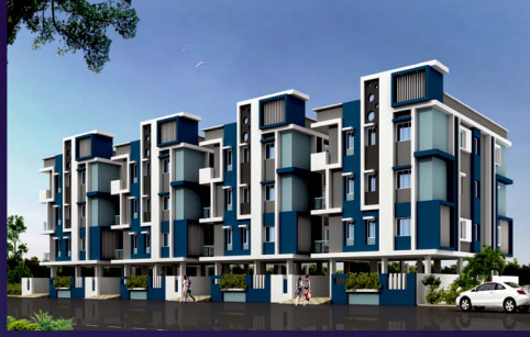
GSR'S Eco Nest, Thunglam, Gajuwaka