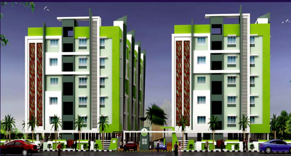
GREEN LIFE APARTMENTS, Gajuwaka